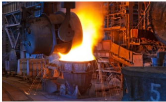
STEEL & LIQUID PLANT